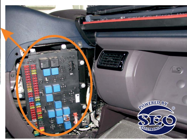
BEHIND THE FUSE BOX