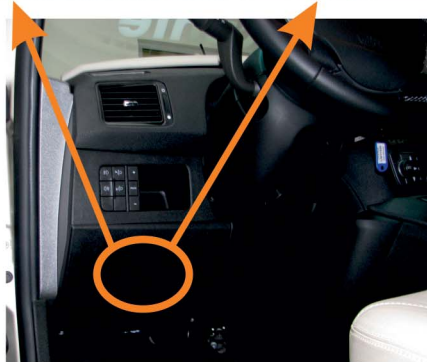
CONTROLLER MODULE (FRONT)