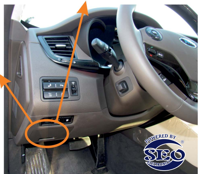
CONTROL MODULE (REAR)