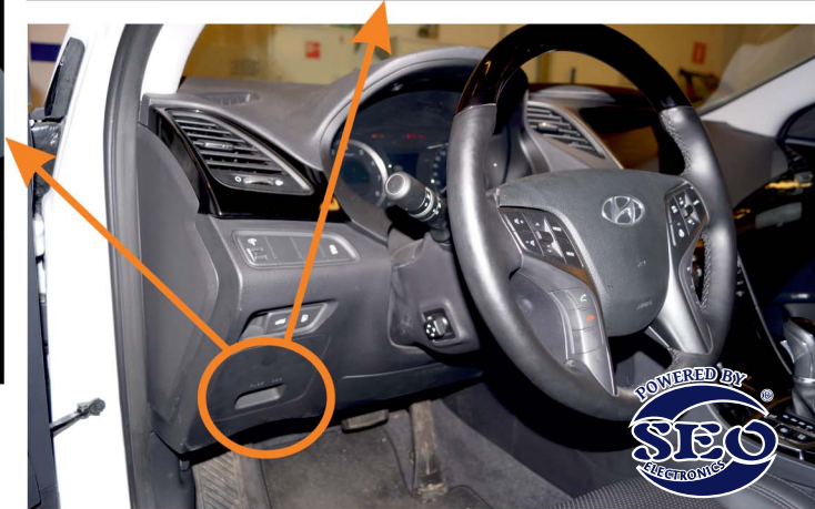
CONTROL MODULE (REAR)