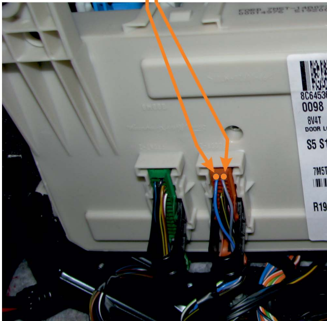
MODULE FRONT (under glove compartment - passenger's side)

brown connector 32PIN blue pin16 CANL grey pin32 CANH brown connector 32PIN