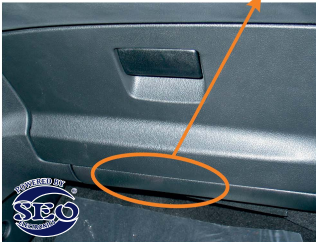
MODULE (under glove compartment - passenger's side)